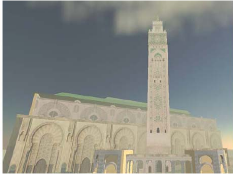
Fig. 2 The Global Outreach Morocco project brought students with backgrounds in technology, business, and hospitality together to study economic development in Morocco through the growth of the travel and tourism industry. Students used Second Life as an education tool to develop specific locations, such as this Hassan II mosque [13].