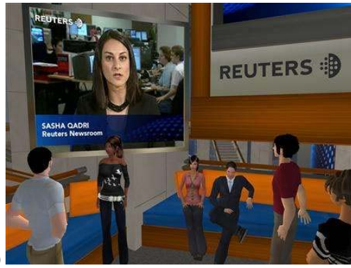
Fig. 3 a) Virtual visiting of the Washington Monument [14]; b) Reuter's virtual news bureau [3]

One interesting aspect of several of these worlds is that they give their users tools that allow them to change the virtual world itself: editing tools (see Fig. 4). Virtual Worlds can, this way, be built from the ground up and developed by its users (players). It is even possible for users have property rights over virtual objects they create, as is the case of Second Life.