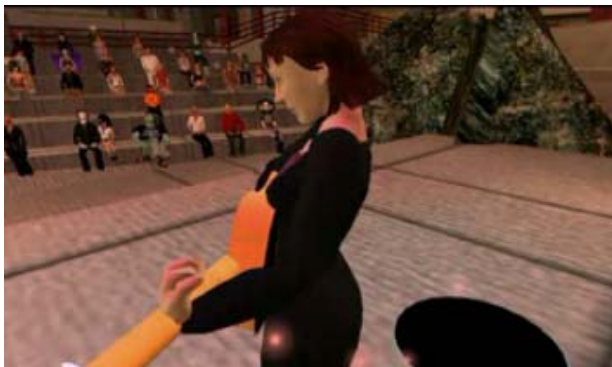
Fig. 1 Singer Suzanne Vega, represented by an avatar, gives a live concert to a Second Life audience. [12]

The versatility allowed by MMOSGs makes them a good platform for several other domains of activity besides socializing activities, such as entertainment, education and business. As an example, we show in Fig.1, Fig. 2 and Fig. 3 some applications already developed by the users of the popular MMOSG Second Life (the most popular MMOSG, if measured by number of subscribers [4]):