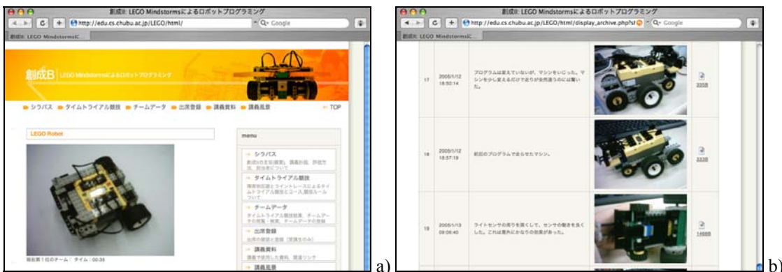
Fig. 2 The creative activity support system. a) Top page. b) Learners’ creative processes.

The information recorded by the learners is updated in real time, so the learners can check the ranking status of their own or other learners’ teams at any time. Using this system, the learners regularly record the status of their groups’ activities. They then create the Reflection Sheet while viewing their own creation processes, which they have recorded in the system, and downloading the appropriate data as required.