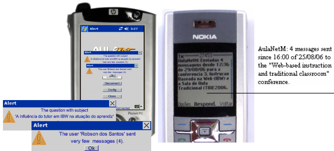
Fig. 3 Example of alerts in AulaNetM.

Mediators and learners receive SMS alerts regarding the activities of the conferences. This research took into account alerts that favored the group and not a particular individual, avoiding alerts such as “your message has received a reply” or “your message has been evaluated”. The alerts inform that a given number of messages have been sent or that a given number of messages have been evaluated. Without more detailed information about the new messages and assessments, learners are expected to access the conference to check if any of these interest them. A case study in the Information Technology Applied to Education course offered by the Catholic University indicated that, with SMS alerts, conference accesses became more effective as the number of situations in which participants accessed the conference and didn't find new messages or evaluations decreased[14].