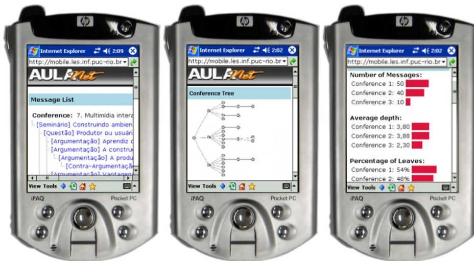
Fig. 2 Example of conference message list, conference structure and charts in AulaNetM.

In light of this, AulaNetM offers mediators the visualization of conference structures and charts about the conference. Number of messages sent by each participant, percentage of messages without replies and number of messages sent per hour during the conference are examples of data presented to mediators (Figure 2). The use of wirelessly connected PDAs presenting data in a statistical and visual form increases the number of opportunities for mediators to access the environment to verify whether they have to intervene in the conference. This concise and summarized information is suitable for quick consultation checks during short periods of time, such as a coffee break or while waiting for a meeting. Case studies indicate that the visual rendering of the conference structure, coupled with PDA mobility, is a useful coordination tool for mediators [13].