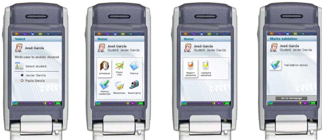
Choose Student Parent Main Menu Parent Secondary Validate Marks Menu